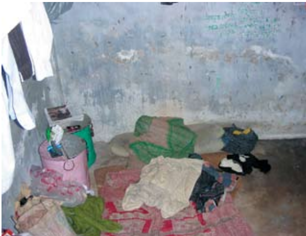
A pile of clothes which serves as bedding. The workers keep rice and some personal belongings in the drums in the corner of the room.