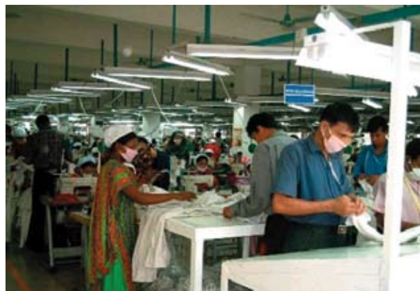
JMS Garments.

These, then, are the companies that appear to be involved in the production of Wal-Mart's school uniform shirt and the relationships between them that we can surmise: Wal-Mart licenses production of its private label Faded Glory school uniform shirts to Garan Inc., which designs the shirts and asks their neighbors in the Empire State Building, Jeasion International, to produce them according to Wal-Mart's requirements. Jeasion sends the design and the order (including the number of shirts and required turn-around time) to JMS Garments, which produces the finished shirts. JMS Garments loads the shirts on a truck which travels a mere 1.5 miles to the Chittagong port, where a ship picks them up and takes them first to the Port of Salalah in Oman, and then to the port of Charleston, South Carolina (this too we learn from PIERS). The Charleston port notifies Garan that the shirts have arrived, and Garan sends them to Wal-Mart, where we can buy them. Along these shirts' travel route, these companies all look to maximize their share of the profits.