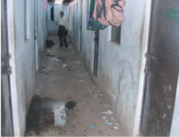
A “colony” of 24-30 rooms which houses at least 100 garment workers. The monthly rent for one room is $20-30.