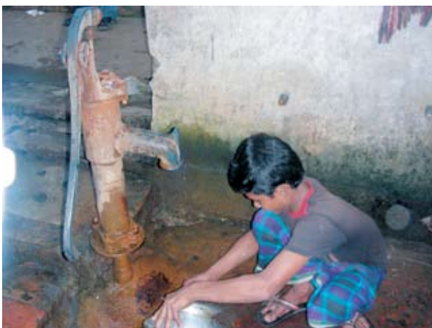
One well serves the whole colony where over 100 garment workers live. They use the water for all purposes, including washing and drinking. This boy is cleaning rice.